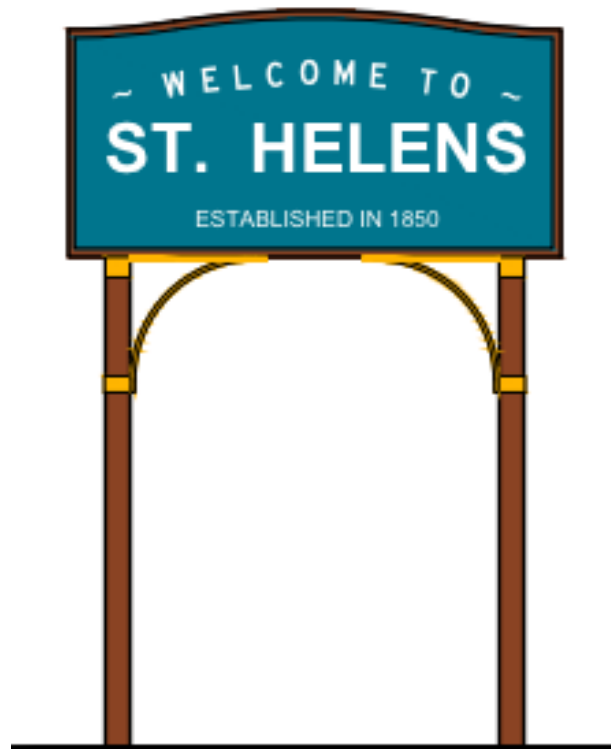
HIGHWAY IDENTITY SIGN